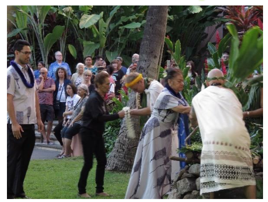
A special sharing of Ho'okupu at the Royal Hawaiian Coconut Grove as the Hawaiian Civic Clubs began celebration of the 2019 Makahiki...