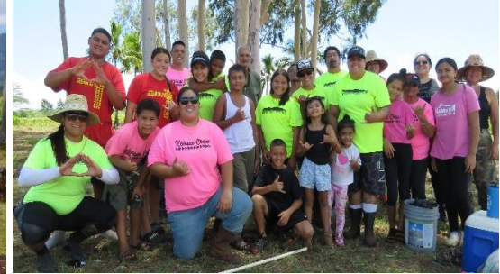
08.17.2k19... Mahalo nui loa ... "ROOTED" Whitmore Village families volunteer on 3rd Saturday Kūkaniloko Oʻahu Community Clean Up days. You are all appreciated! Aloha nō...Eō