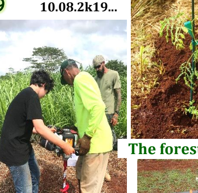
The forest begins with 100 trees...