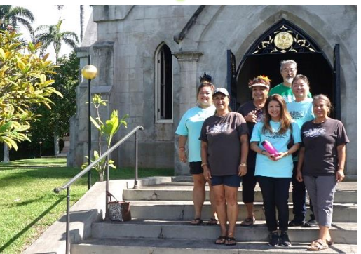
10.02.2k19 ... 7 members represented HCCW for our annual cleaning of Mauna Ala. Mahalo.